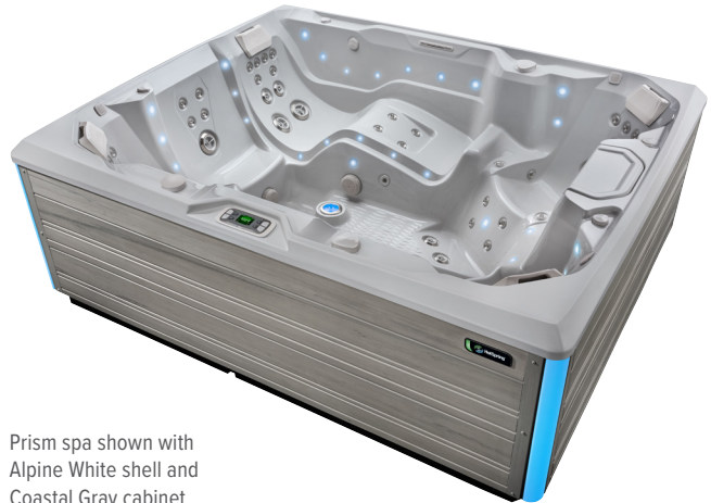
Prism spa shown with Alpine White shell and Coastal Gray cabinet.